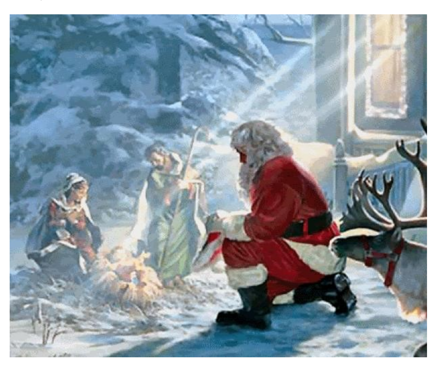
Christmas holidays begin Saturday, December 21, 2024. We will see all of you back on Monday, January 6, 2025 at 8:25 a.m.